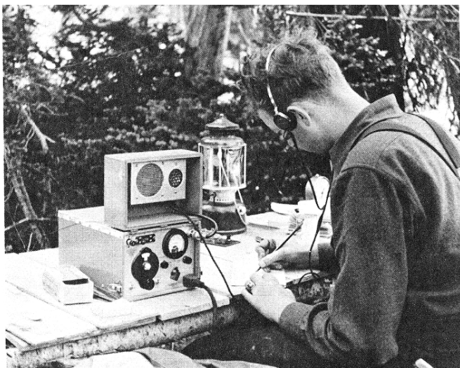
Portable USFS HF transceiver in operation at the Bull Lake Fire, Kootenai National Forest, 1939

Spearheaded by a grizzled forest ranger and radio hobbyist in 1927, the USFS pioneered the development of compact, rugged, simple field communications gear in the Pacific Northwest during the 1930's and 40's. A handful of forestry engineers, almost all of them radio amateurs, solved the problems of radioing through heavy timber and over mountains, becoming the first to discover and exploit a new high-frequency skywave propagation mode. Their VHF equipment surpassed all others in portability, performance, and innovation. This presentation will feature dozens of vintage photographs, a film excerpt, and exhibits and demos of rare Forestry radio gear dating from spark transmission to a 1930's HF QRP portable transceiver.